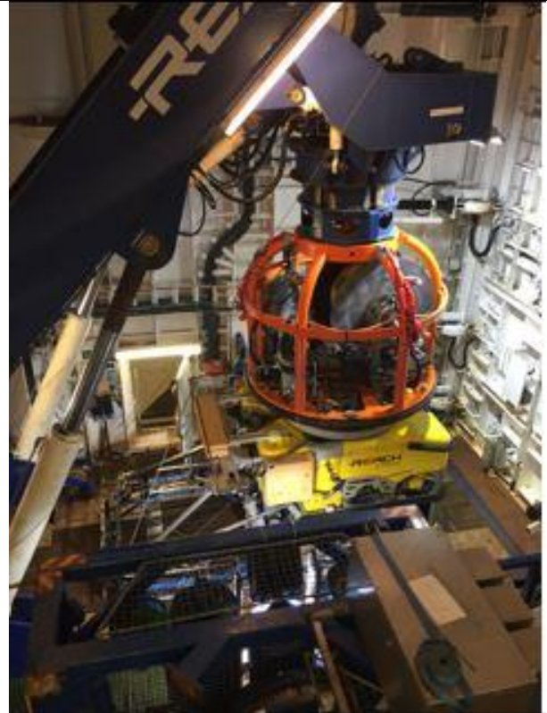
ROV in Hangar