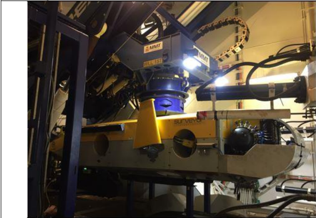
SROV in Hangar